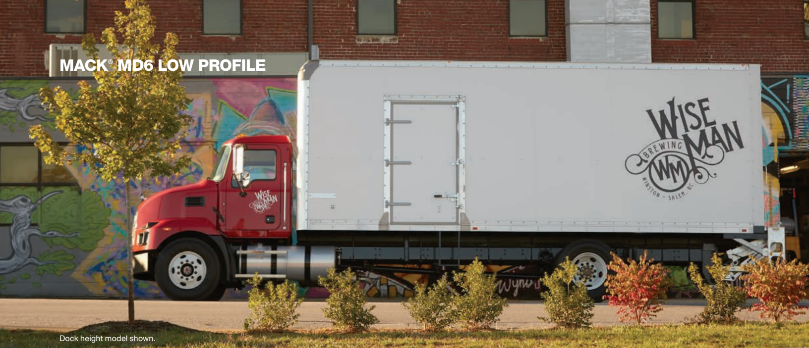
Dock height model shown.